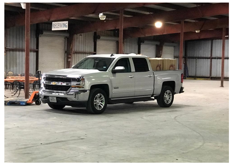
One of the loaded pickups, this one heading to Audie Murphy VA Hospital